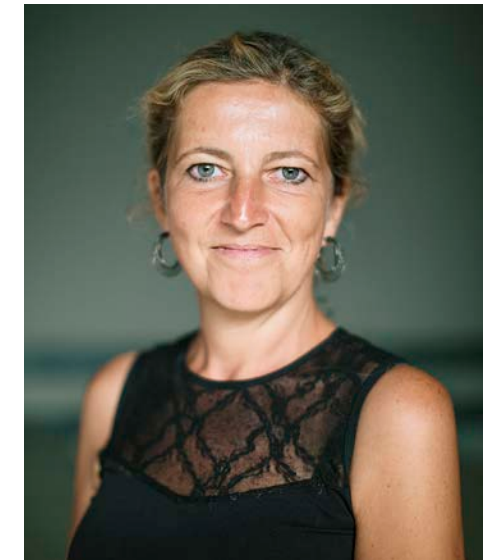
Professor Katya Scheinberg

At Cornell, Scheinberg plans to continue her work related to developing practical algorithms and their theoretical analysis for various problems in continuous optimization, such as convex optimization, derivative free optimization, machine