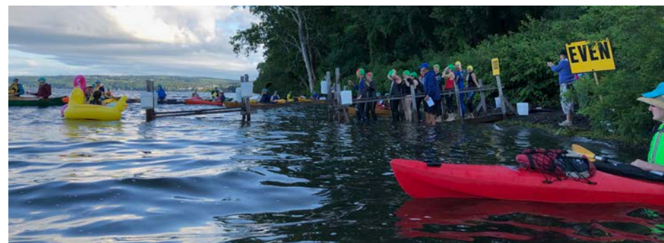
Swimmers and their boating escorts prepare to leave the east shore of Cayuga Lake for the 1.2 mile swim to the Ithaca Yacht Club.

At the start of the 2018-19 academic year, the Operations Research and Information Engineering (ORIE) Master’s of Engineering (M.Eng.) program invited 12 companies and groups from the Cornell and Ithaca communities to present challenging