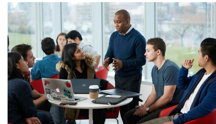
Cornell Tech fosters creativity and collaboration among students and faculty.

The first class of eight students arrived in the fall of 2016 to tackle such questions as how much stock a company such as