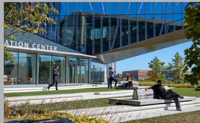
Students study, mingle and head to classes at the Cornell Tech campus in New York City.